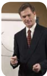
Boss Access: All Features

Walk-up copying, scanning, and faxing are all great conveniences. However, you may want to limit access to select features, especially if you are handling confidential records and data, or to restrict access to printing to keep your operating costs down. So the MFC-9840CDW provides the ability for your administrator to set various levels of password-protected access to certain features, for each of up to 25 different users per machine.