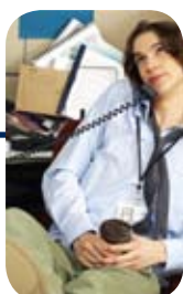
Intern Access: Copy Only