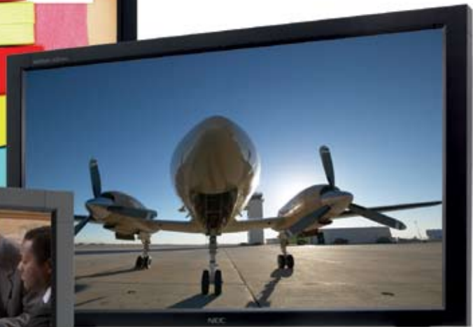
Airports/flight and baggage information